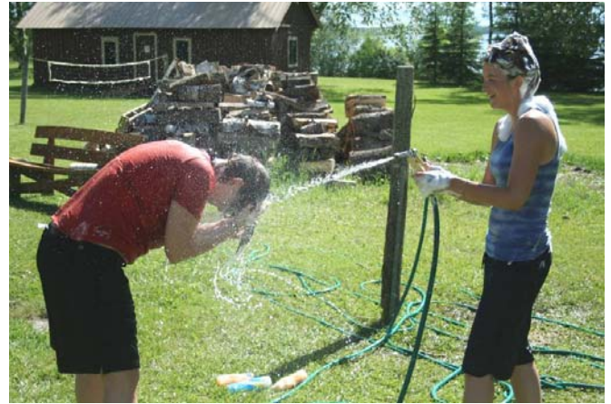
The ladies' showers had some plumbing issues one week... Some were more committed to personal care than others. (That particular faucet is never warm...)

A relatively new part of DLBC is a something referred to as "life is worship." For a portion of each day, campers have the opportunity to explore creative or artistic means of expressing their faith. The photo at left is one individual's representation of a few passages from the New Testament.