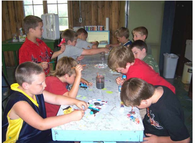
some very crafty young fellows...