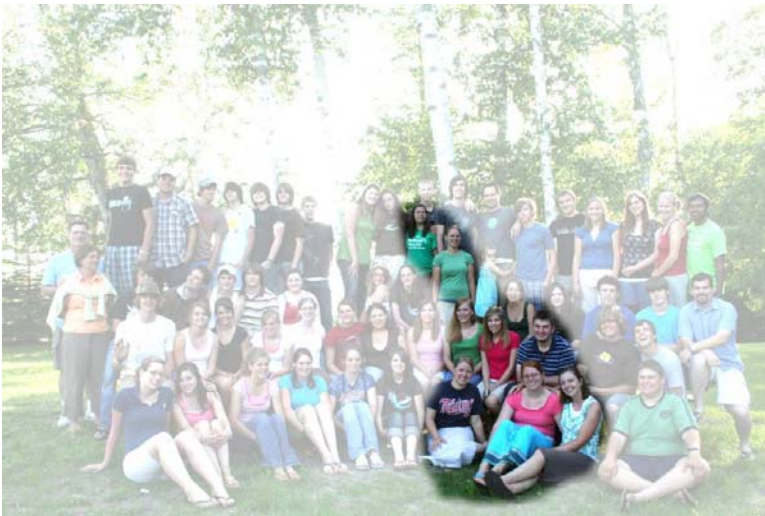
...and those committing to service in our Lord's name...

"Paul then stood up in the meeting of the Areopagus and said: 'Men of Athens! I see that in every way you are very religious. For as I walked around and looked carefully at your objects of worship, I even found an altar with this inscription: TO AN UNKNOWN GOD. Now what you worship as unknown I am going to proclaim to you. The God who made the world and everything in it is the Lord of heaven and earth and does not live in temples built by hands. And he is not served by human hands, as if he needed anything, because he himself gives all men life and breath and everything else.'" ~Acts 17:22-25