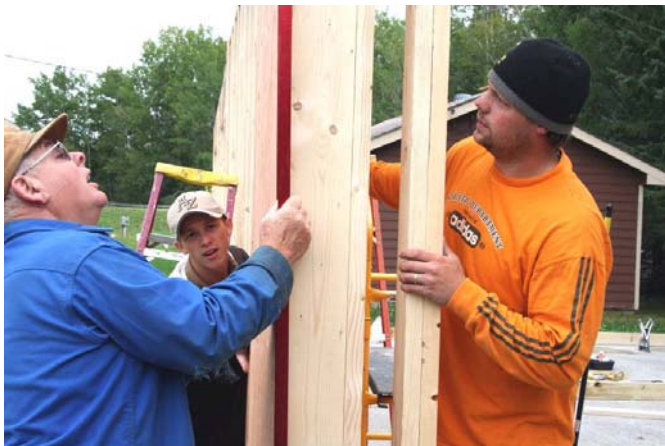
“Does that look plumb to you?”

Finishing this project will be something that will benefit DLBC’s ministry for decades to come, and it’s something that could be done with very little sacrifice on anybody’s part if we band together and work as one. The DLBC camp board has collectively committed to matching $10,000 in contributions toward this project, and most of us were also around to help drive nails on a recent (somewhat rainy) September weekend. We’re committed to seeing this project through to a finish, and humbly ask for your help in this effort.