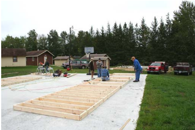
Building walls on the new basketball court