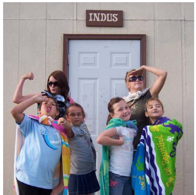
Discovering the super-hero within