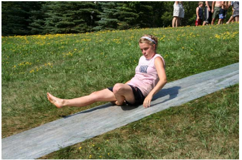
Roll of plastic: $10 Electricity to run garden hose: $0.10 Using tongue to steer down impromptu water slide: priceless