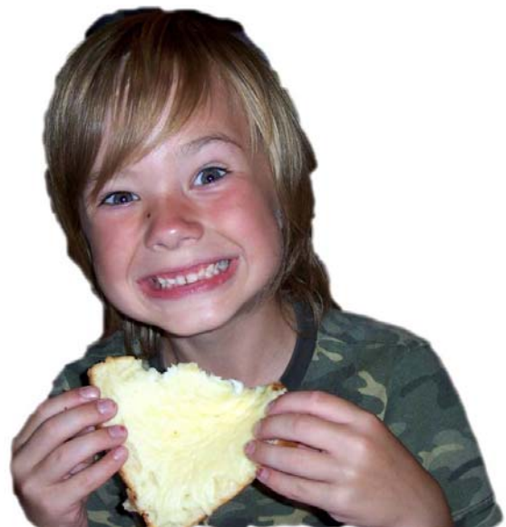
The cheesy bread passes inspection.