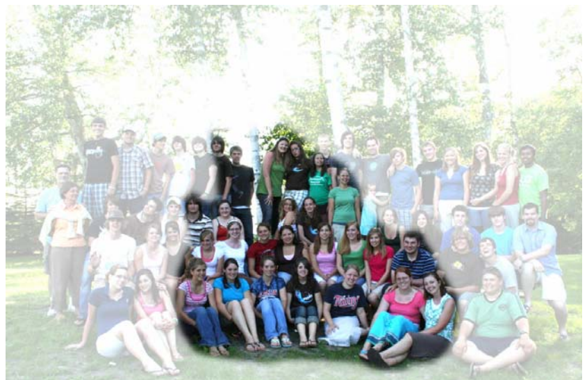
...and expressing renewed dedication to Christ, or a spiritual decision/commitment of some other form.