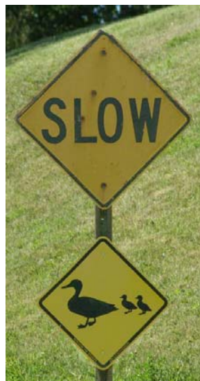
Beware of levitating ducklings