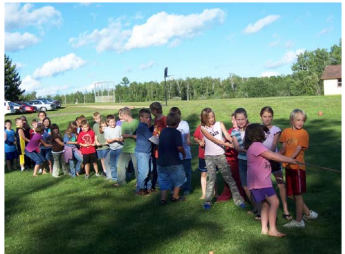
With enough hands on the rope, even small people can move big things.

It’s a bird! It’s a plane! It’s... A showerhouse? YES! Despite the often-slow progress leading up to this point, some very significant progress is being made on the ladies’ shower house & bathrooms, as should be apparent from the photos here. On September 8 th , a number of skilled volunteers joined forces with the DLBC camp board to frame and sheath the ladies’ shower house. In a single day’s work, this project went from being an empty concrete slab to having the framing nearly finished. This is a very exciting development, because with the framing done and the structure mostly enclosed, work can now progress through the winter months—no more waiting for snow to go away. The shower house could very easily be ready in time for camp next year, IF we can raise the necessary funds to complete it. This doesn’t have to be a painful task, because the power of teamwork in the act of giving is no less significant than it is in the process of building. Putting the rec hall deck up took the better part of three months worth of weekends for a lone individual who had occasional help. In contrast, the cooperative efforts of a dozen or so workmen put up the structure of an entire building in a single day. Likewise, putting siding, shingles and windows on the showerhouse might require a year’s worth of one man’s savings. But if everybody who received this newsletter were to contribute one portrait of President Hamilton, it would happen without much inconvenience or burden to anyone.