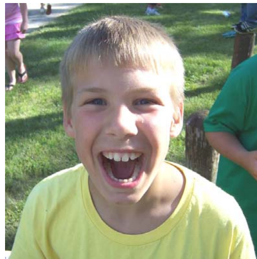
A mildly enthusiastic camper