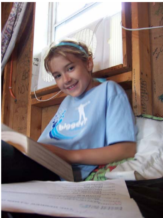
Taking time to read a good book