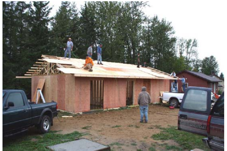
Near the day's end