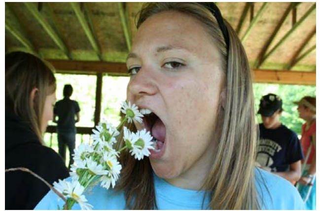
This salad was not very popular. Please, pass on your recipes for better ones.

Like everything else at DLBC, running the camp kitchen is a volunteer effort. Over the course of a typical summer, several dozen individuals take time out of their schedules to be a part of camp in this way. Below is a letter from one such volunteer that was originally sent to the seven Minnesota churches that are formally associated with DLBC. It's being re-printed here to pass the message along to those who may be part of other church bodies.