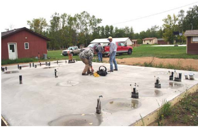
Day began with an empty concrete slab