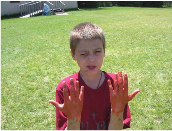
Fun occasionally requires getting one's hand dirty.