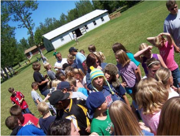
the lunch line