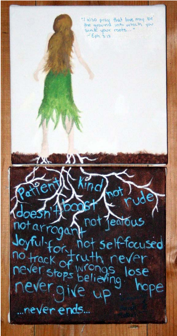
An illustration of Eph 3:12 and 1 Cor. 13