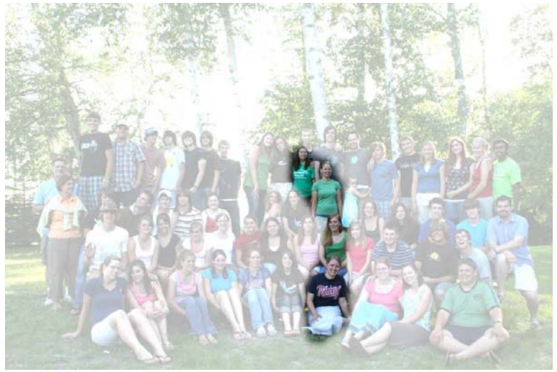
Representing those who received salvation...

The photos here are an attempt to visually represent the number of campers making various commitments over the course of the