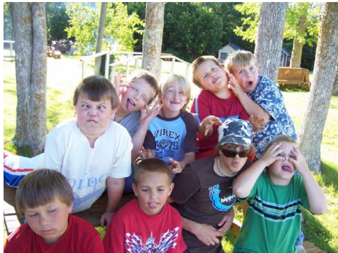
Nobody's face got stuck that way. A small measure of WD-40 was required, however...

Stories that included these kinds of statements used to bug me. These stories don't bother me as much any more. I realize that when these stories are told, those that do the telling realize that they are not where they should be in their spiritual journey. They are struggling, looking for help, support, and prayer. But in all of this they are trying to move forward in their journey, they are not stopping, they are not getting comfortable where they are at. They are moving forward in their walk with Christ.